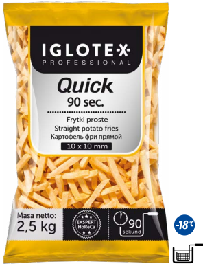
Quick 90 sec. straight fries 10x10

net weight 2,5 kg EAN 5 902 162 362 116 pieces in box 5 pieces on layer 45