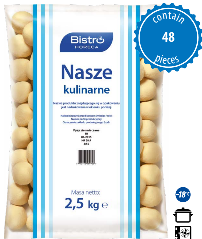
Potato dumplings with meat

net weight 2,5 kg EAN 5 902 162 272 620 pieces in box 4 pieces on layer 36