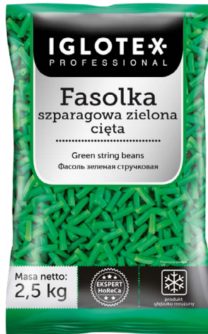
Green string beans (cut)