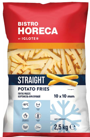
Straight fries 10x10

net weight 2,5 kg EAN 5 902 162 367 418 pieces in box 5 pieces on layer 45