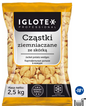
Jacket potato wedges

net weight 2,5 kg EAN 5 902 162 362 611 pieces in box 5 pieces on layer 45