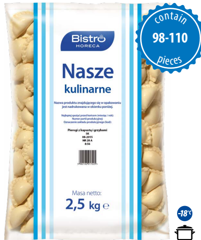
Dumplings filled with sauerkraut and mushrooms

net weight 2,5 kg EAN 5 902 162 213 029 pieces in box 4 pieces on layer 36