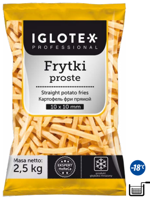
Straight fries 10x10

net weight 2,5 kg EAN 5 902 162 362 413 pieces in box 4 pieces on layer 36