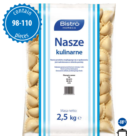
Dumplings filled with cheese

net weight 2,5 kg EAN 5 902 162 212 923 pieces in box 4 pieces on layer 36