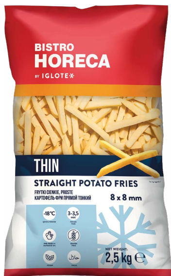
Thin straight fries 8x8

net weight 2,5 kg EAN 5 902 162 367 418 pieces in box 5 pieces on layer 45