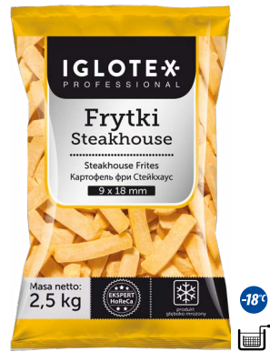
Steakhouse fries 9x18

net weight 2,5 kg EAN 5 902 162 362 314 pieces in box 5 pieces on layer 45