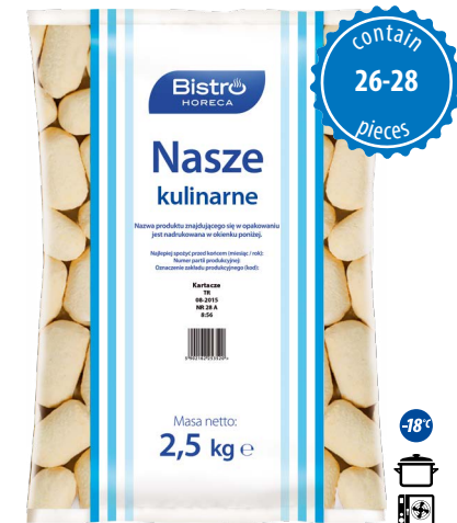
Zeppelins with meat

net weight 2,5 kg EAN 5 902 162 008 205 pieces in box 4 pieces on layer 36