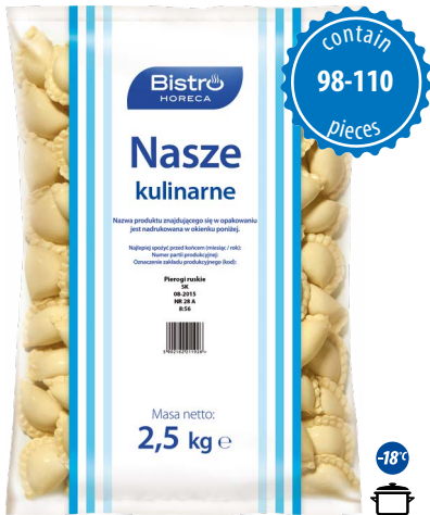
Dumplings filled with potatoes and curd cheese

net weight 2,5 kg EAN 5 902 162 213 029 pieces in box 4 pieces on layer 36