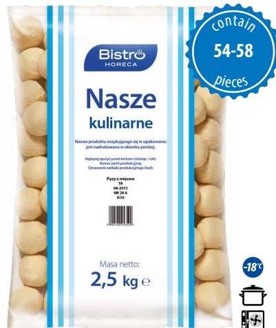
Sweet dumplings with strawberries

net weight 2,5 kg EAN 5 902 162 253 520 pieces in box 4 pieces on layer 36