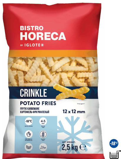
Crinkle fries 12x12

net weight 2,5 kg EAN 5 902 162 367 319 pieces in box 5 pieces on layer 45