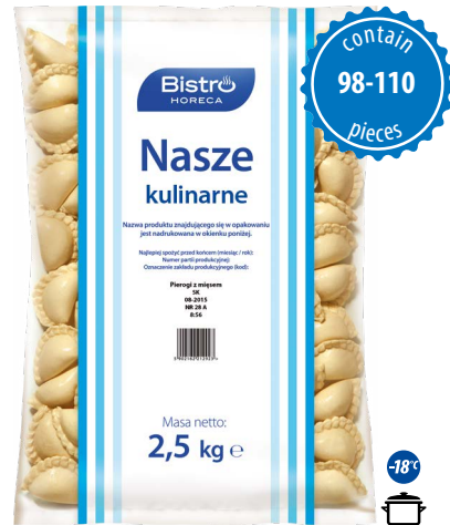
Dumplings filled with meat

net weight 2,5 kg EAN 5 902 162 217 225 pieces in box 4 pieces on layer 36