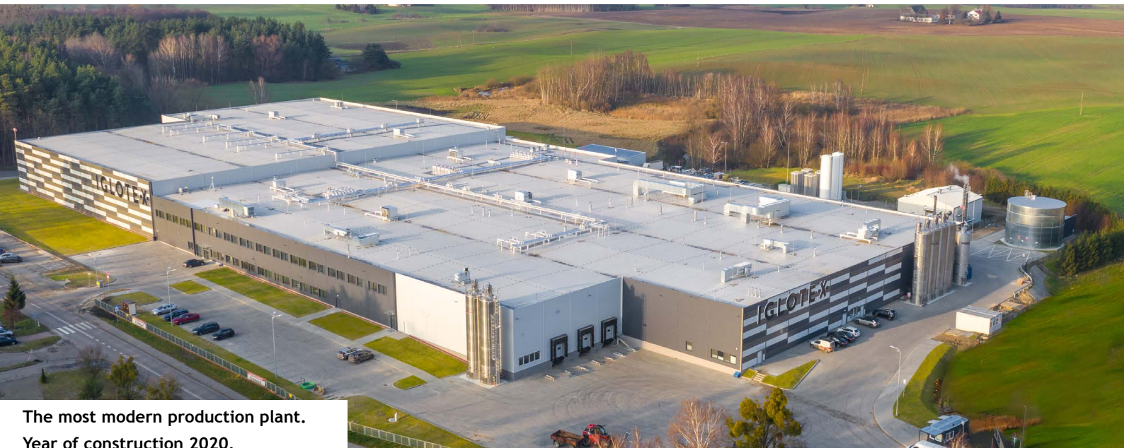
The most modern production plant. Year of construction 2020.

Inside you will find Iglotex offer dedicated to HoReCa market.