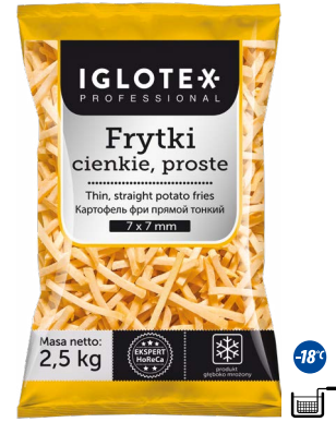
Thin straight fries 7x7

net weight 2,5 kg EAN 5 902 162 362 215 pieces in box 5 pieces on layer 45