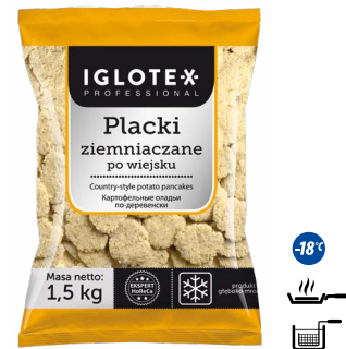
Country style Potato pancakes

net weight 2,5 kg EAN 5 902 162 362 710 pieces in box 5 pieces on layer 45