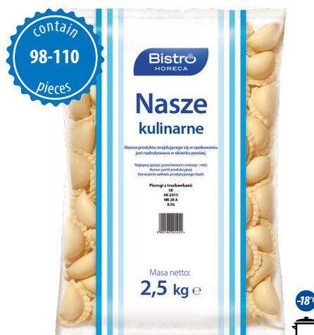
Dumplings filled with strawberries

net weight 2,5 kg EAN 5 902 162 209 923 pieces in box 4 pieces on layer 36