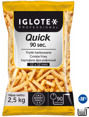
Quick 90 sec. crinkle fries 12x12

net weight 2,5 kg EAN 5 902 162 362 116 pieces in box 5 pieces on layer 45