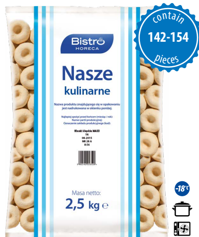
Silesian dumplings MAXI

net weight 2,5 kg EAN 5 902 162 276 420 pieces in box 4 pieces on layer 36