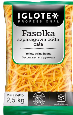
Yellow string beans